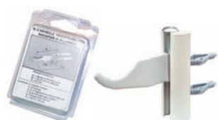
A027 universal brackets white blister pack (pair)