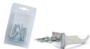
A029 square brackets white blister pack (pair)