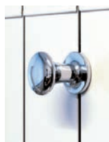
A237 white handy grip A238 chrome handy grip