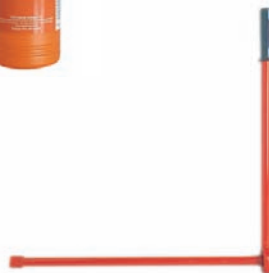
A079 hex key with lever A080 hex key 500 mm A081 hex key 800 mm