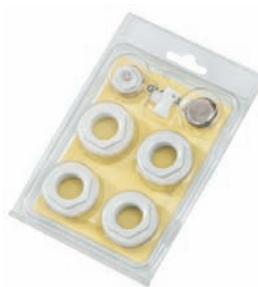
REDUCER KIT WITH SILICONE GASKETS AND ADJUSTABLE VALVE A043 3/8" for 200/D radiators - 800 mm - white or chrome A046 1/2" for 200/D radiators - 800 mm - white, chrome, special colours A048 3/4" for 200/D radiators - 800 mm - white or chrome